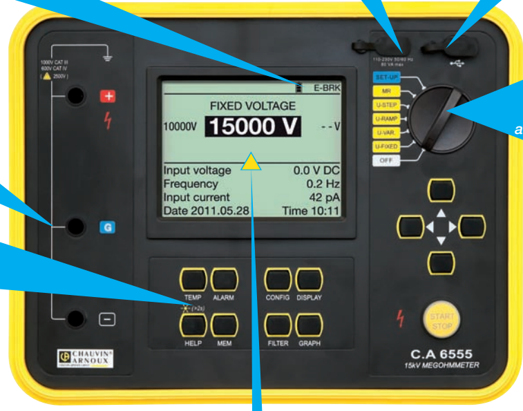
Large backlit graphic LCD screen

START/STOP button to trigger measurement