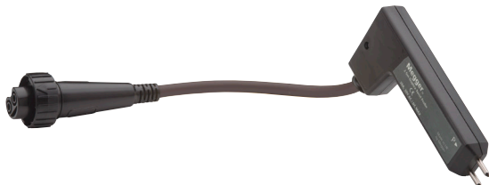
DTP1-C Duplex Twist Probe 1 - Connect Order part number: 1006-449

Spare / optional parts Order part number: Replacement needle tips 2003-551 Waffle / serrated tips 25940-014