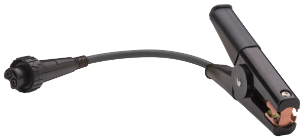
KC1-C Kelvin Clip 1 - connect Order part number: 1006-447

Spare / optional parts Order part number: Replacement P needle tip 2003-551 Waffle / serrated P tip 25940-014