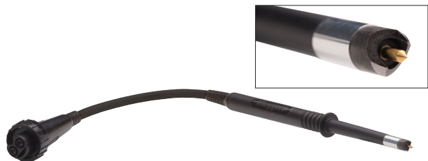
CP1-C Concentric Probe 1 - connect Order part number: 1006-448

Duplex connect concentric handspike with sprung loaded potential tip fitted with a connector socket for easy connection to any connector test lead. The C connection is made via an outer hardened and tempered steel crown with two contact points or tips. The replaceable central potential probe tip has a hardened needle point, gold plated for excellent low resistance contact. The P tip is sprung to provide 1.3kg of force and uses a stainless steel spring. Ideal for general applications where a good reliable connection is required on none coated or corroded surfaces. The long probe length and small diameter makes this probe ideal for reaching deeply recessed terminal screws. There are also applications where connection to rivet heads or screw/bolt heads are required. To further limit the possibility of damage to test piece waffle tip, sometimes referred to a serrated tip is available as an option.