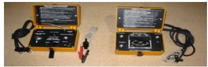
Proving Unit & Repeater Station