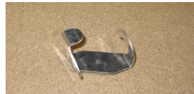
Over Head Line Adaptors