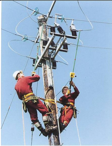
Overhead Line Testing