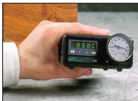
Take the 9100S anywhere. It's the smallest dry-well in the world.

Plug it in, switch it on, set the temperature with the front-panel buttons, and insert your probe into the properly sized well. Compare the reading of your device