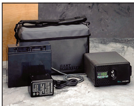
Model 9102S shown with battery pack, which includes a battery, carrying bag, cables, and charger.